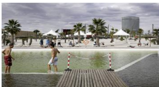
Graphic 8. Zaragoza river beach

Water is taken from the river Ebro, from the Rabal irrigation ditch (coming from the river Gállego) and from underground water (water table). It is regulated in the deposit canal, passes by the aqueduct, is distributed by pools and canals, arrives clean to the bath areas where a beach has been built for leisure ( graphic 8 ), is reused for watering and comes back to the river.