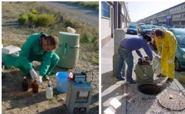
Graphic 6. Samplings taken from industrial areas where the volume of flow, the continuous measure of physical parameters and the integrated samplings of 24 hours are made

The own staff, the municipal laboratories and the Ebro Basin Agency control that the results are within the limits ( graphic 6 )