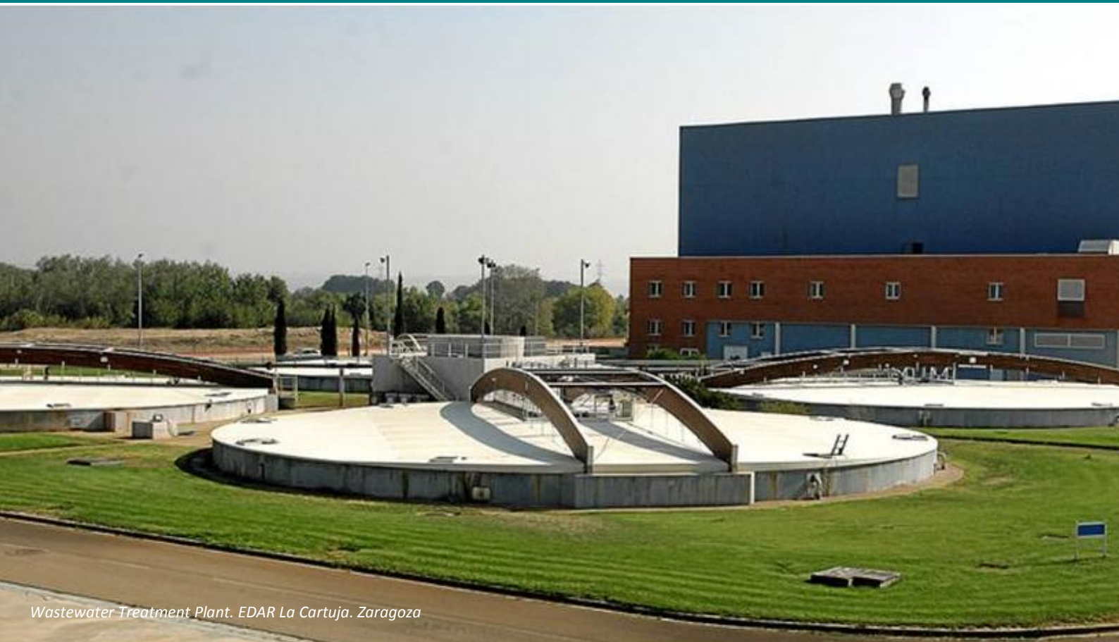
Wastewater Treatment Plant. EDAR La Cartuja. Zaragoza