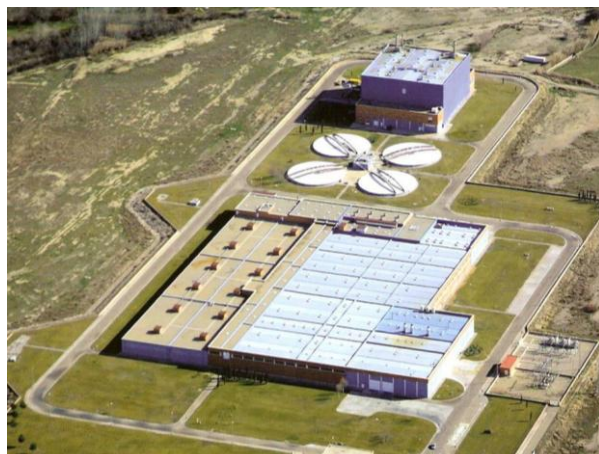
Graphic 1. The enclosure and deodorization system of La Cartuja waste water treatment plant makes it different from any other conventional treatment plants